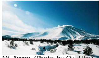
Mt. Asama

Hike Mt. Hanare: From the elementary school at the foot, 40 min. walk. The cave where bandits lived. Mt. Atago: From Kyu Karuizawa 30 min. walk. Atago shrine dedicated to the God of fire. Unique rock called "Organ Rock". Usui Pass Area: From Kyu Karuizawa 60 min. walk. From the front of Tourisit information center, 10 min. bus (one-way ¥500, round-trip ¥800, only in summer). The hike of these three mountains is easy and the scenery is wonderful on a sunny day. Attention to wild animals.