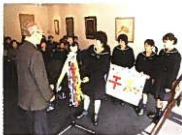
Students presenting paper cranes

When we receive the reservation for a visit from a school, we ask the teachers to visit our center in advance if possible, and prepare for the visit. We ask them to show the students some visual materials before their visit, and raise