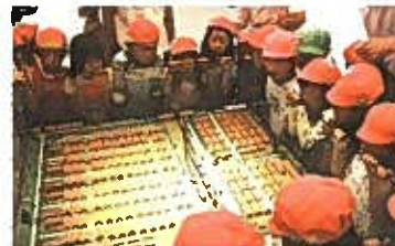
Nursery school children

One group of students from a near by Junior High School visited our center and asked questions such as: "Why was this center established here?", "How many staff members are working here?", "What kind of feelings do staff members have when they are working here?"