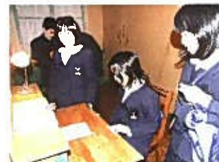
Students in Anne's room

We are happy that the new center is accomplishing its aim as an education center to the young people in Japan.