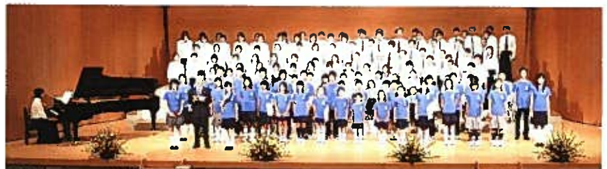
Small Hands and the Choir

One member of the audience, who came with her daughter, said, "I was moved because I felt all the people's hope for peace. I want to tell this feeling to my children."