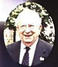
Mr. Y. Navon 5th President of Israel